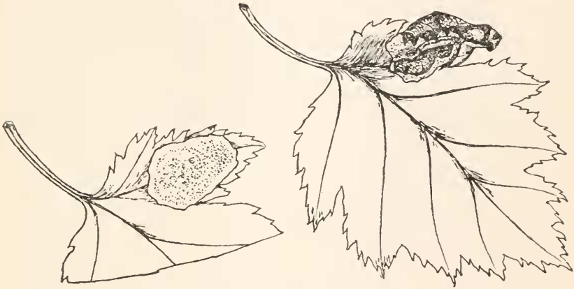
Mine of Ornix inusitatumella Chamb.

Mr. Chambers' original description of this species is incorrect and was probably made from a rubbed specimen, as his type has been pronounced identical with O. crataegifoliella Clem. A series of bred specimens of inusitatumella shows that it is not even closely related to crataegifoliella , the most marked differences being the uniform ground color of the wings and the three entire ciliary lines.